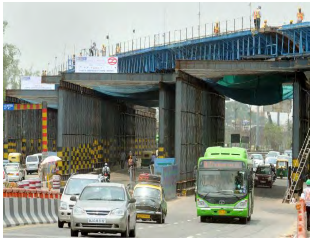
Construction underway in 2009 for the high speed railway line connecting New Delhi railway station with the international airport.