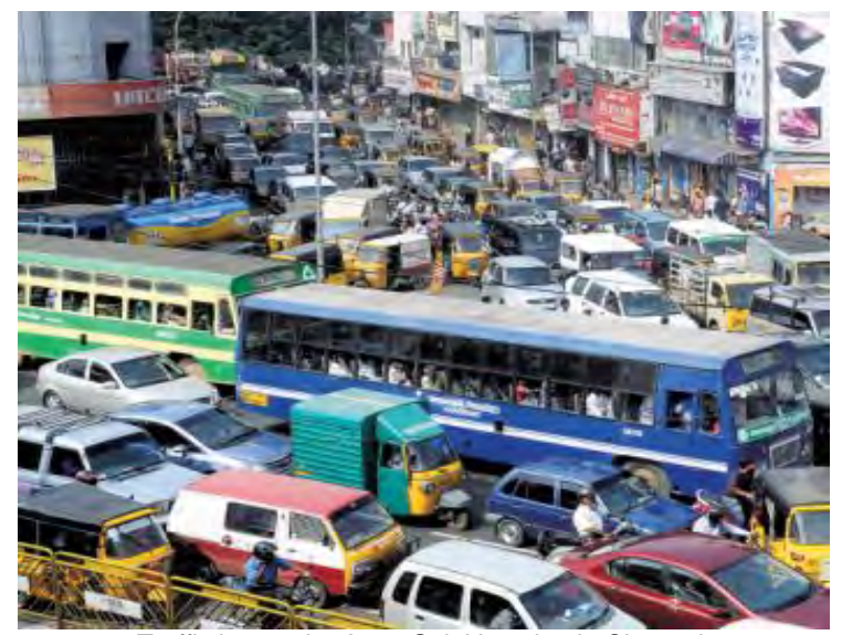
Traffic jam at the Anna Salai junction in Chennai.

The Tamil Nadu Government proposes to enact a law to give statutory authority to the Unified Metropolitan Transport Authority (UMTA) soon. The authority will enable creation of a multimodal transport system that will integrate the various public transport systems available in Chennai ... The objective is to integrate all the modes of transport in Chennai including buses, local trains and the MRTS (Mass Rapid Transit System), along with the proposed Metro Rail and Bus Rapid Transit System (BRTS) to provide seamless travel to passengers across the entire network.