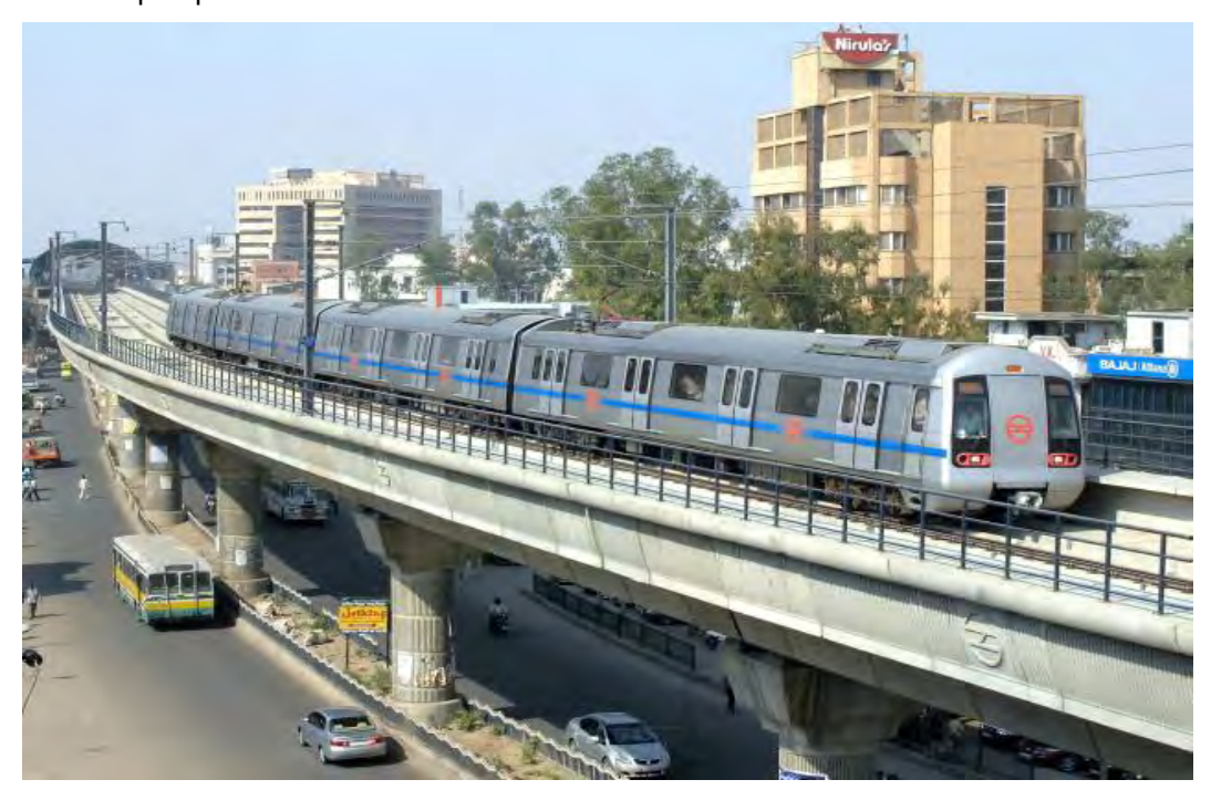
The Anand-Vihar line, the fourth on the Delhi Metro network, opened January 2010

In this issue, we offer a series of visuals on developments in transport that might be of value for a class considering aspects economic development and environmental sustainability for Paper 1, Theme 2 (third Key Issue) and Paper 2, Case Study 2. Following the model tried out in India Matters 6 , we have combined pictures with articles from a variety of sources to enable broad classroom discussion that engages with different perspectives.