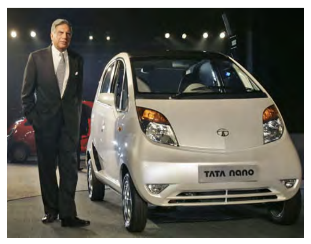
The Tata Nano unveiled at the Auto Expo, New Delhi, 2008. The commercial launch followed in 2009