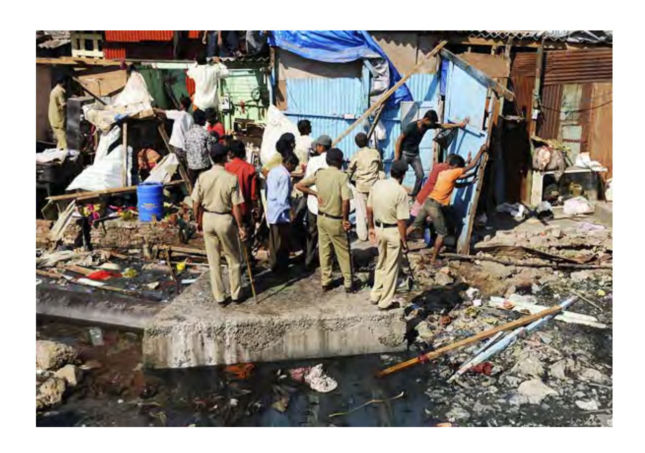
Cambridge IGCSE India Studies Newsletter 7 June 2010